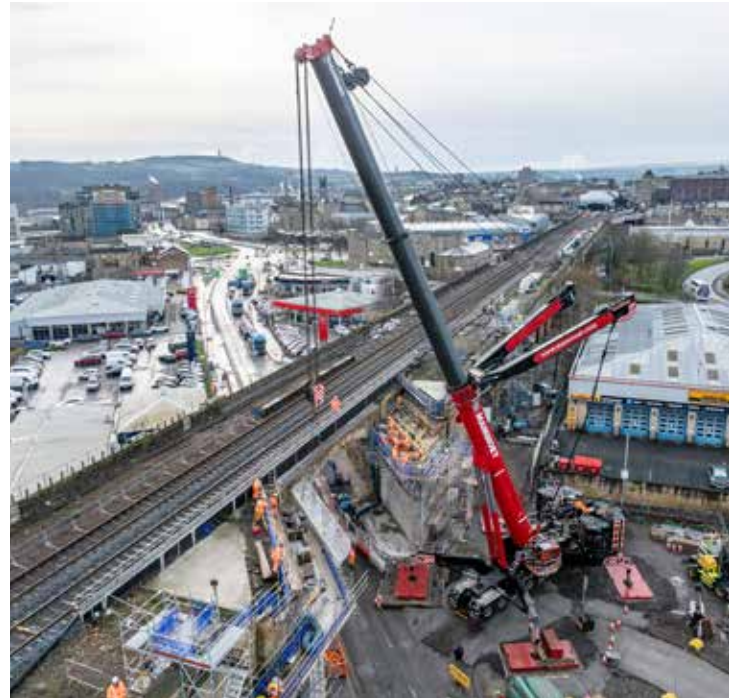
Back in January 2025, a 750-tonne crane was put in place to help strengthen a bridge deck near the station

Track and signalling works: Engineers will install new track and renew drainage, while signalling commissioning work will also take place. These works will affect services between Stalybridge and Huddersfield, as well as services on the Penistone Line between Huddersfield and Sheffield, improving the overall reliability of the railway for years to come.