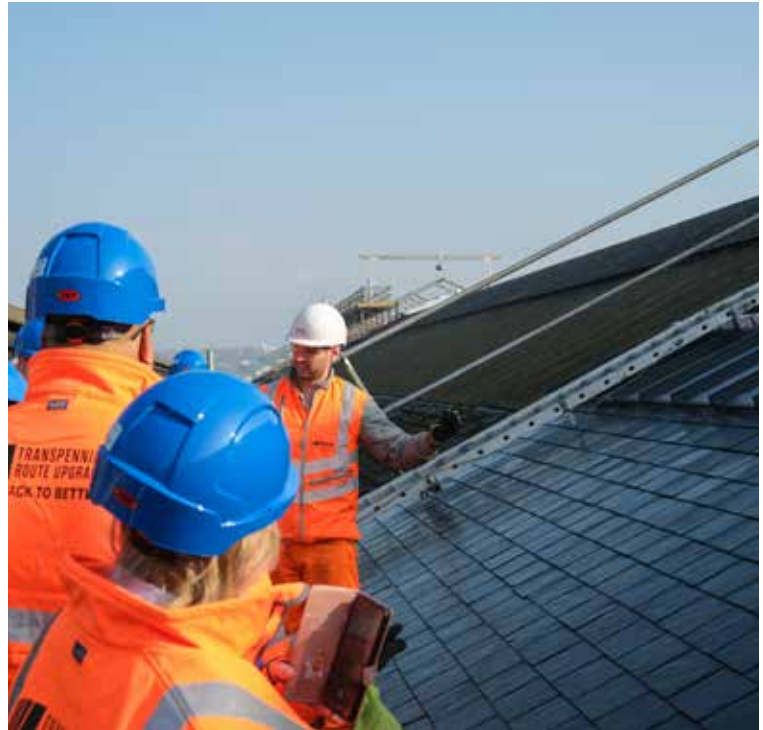
Members of the Huddersfield station team are shown the progress to the Manchester end of the station roof

Rerouting cabling: A lot of work has been carried out under the track, rerouting signalling cables to prepare for Huddersfield signal box to come down, which will also take place during the 30-day closure.