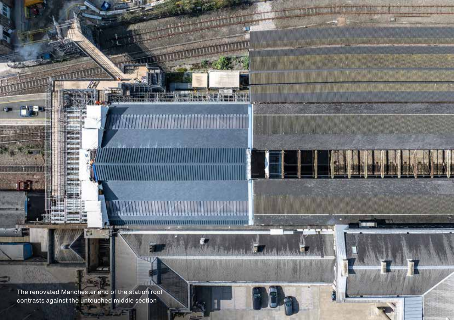
The renovated Manchester end of the station roof contrasts against the untouched middle section