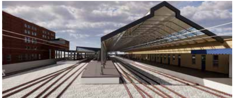
An artist's impression of the upgraded station with the renovated roof