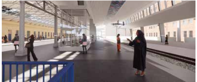
An artist's impression of the upgraded Huddersfield station

Waiting room revamp: The Grade II listed tearoom will be moved to a new location on its current platform to provide an improved space for passengers while they wait for services.