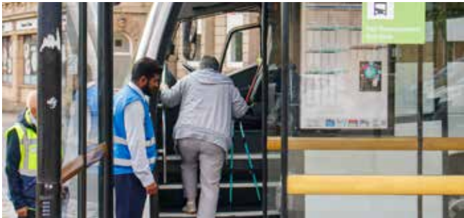
A passenger is helped on a rail replacement bus service

Please note: the impact to services will vary significantly on Sunday 28 September. Please check before you travel.